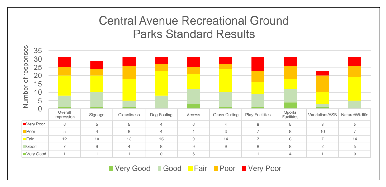
Figure 2: Central Avenue Recreation Ground, Stapleford Park Standard responses.

There were a total of 31 responses for the ten survey themes. This equates to 7% of the overall response rate. The results for the park are shown in Figure 2.